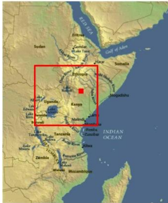
Figure 1. HerderLand (small, solid square) and RiftLand (large, open square) model areas of East Africa.