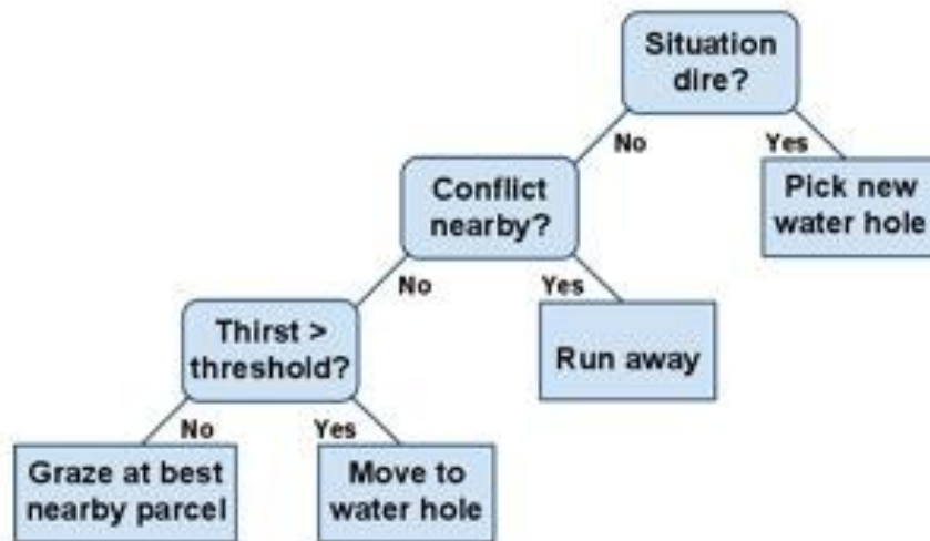
Figure 2. Herding Decision-Making Tree

The herding activity operates very much like the dedicated herders of the HerderLand model. When herding, the herders decide daily where to move the herd based on four factors. These factors represent the herd’s level of hunger, level of thirst, whether there is conflict in the area, and how far away the herd may have to move. The rules are implemented as a hierarchy of if-then questions based on the importance of the factors modeled after Gigerenzer’s “Fast and Frugal” decision making architecture described in Kennedy and Bassett (2011). The decision tree is shown in Figure 2.