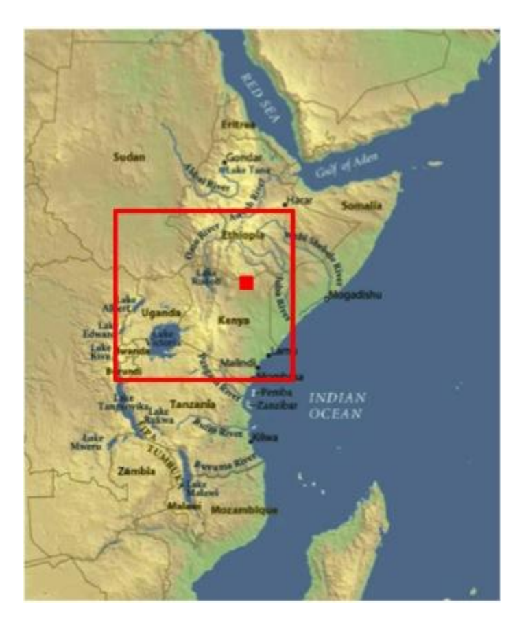
Figure 1. HerderLand (small, solid square) and RiftLand (large, open square) model areas of East Africa.