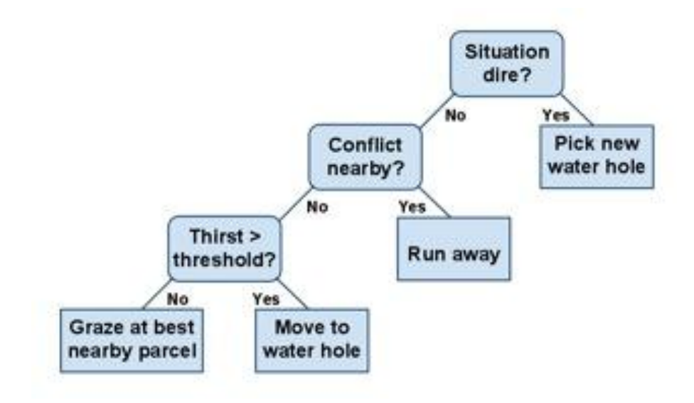
Figure 2. Herding Decision-Making Tree

The herding activity operates very much like the dedicated herders of the HerderLand model. When herding, the herders decide daily where to move the herd based on four factors. These factors represent the herd's level of hunger, level of thirst, whether there is conflict in the area, and how far away the herd may have to move. The rules are implemented as a hierarchy of if-then questions based on the importance of the factors modeled after Gigerenzer's "Fast and Frugal" decision making architecture described in Kennedy and Bassett (2011). The decision tree is shown in Figure 2.